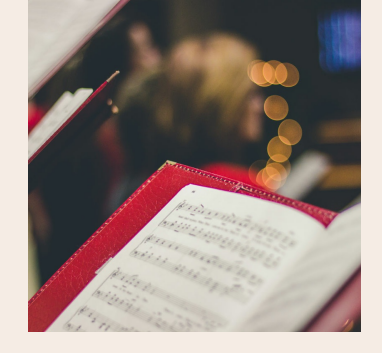
December 17 at 11:00 am in the sanctuary

Inspired by door-to-door caroling experiences, this service of worship, led by the Youth Choir, Adult Choir, and Pullen Orchestra, will involve the gathered congregation in expressing Christmas through song.