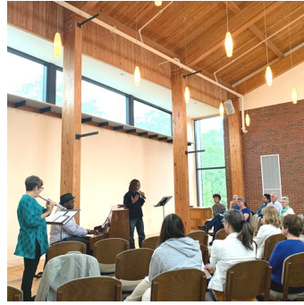
Jazz Vespers, June 13