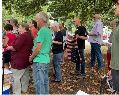
Pullenites attending a Prayer Vigil in Support of Immigrants Affected by HB370 & HB135, June 26