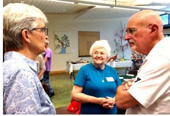
PMW End of Year Dinner, June 5