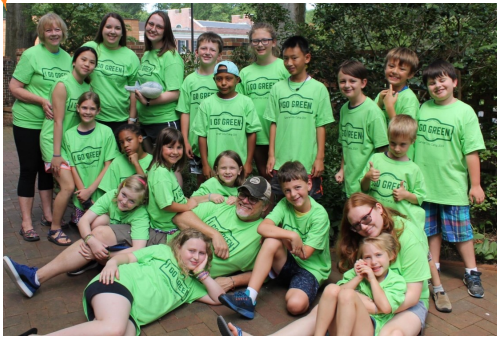
I Go Green children's camp, June 24-28