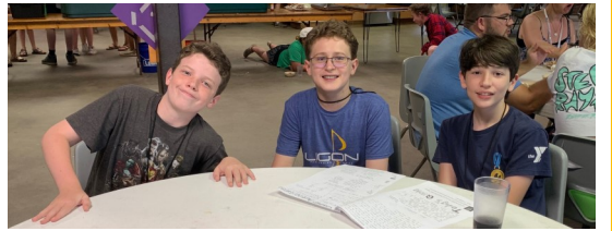
Baptist Youth Camp, June 30-July 5