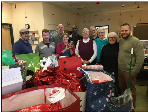
Church staff look over gifts donated for Hope Center clients and families.

In this dark season as we celebrate the miracle of the return of light, we at the Hope Center will be reflecting on the light you brought to the families we serve and the light you brought to us through your generous support of the work we do.