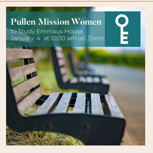
Pullen Mission Women Meeting January 4 from 10:00-11:30 am on Zoom

Are you thinking about joining Pullen, or just want to learn more? Pullen 101 is a unique opportunity to hear from Pullen staff and members about our history, values and the ways we put our faith into action. The intimate 7-week class gives you an opportunity to ask questions and get to know other people at the church. Pullen 101 is for those who are new to the community, thinking about joining or just want to get a better sense of who we are. Pullen 101 will be held on Zoom on Sundays from 9:30-10:30 am, January 16 -