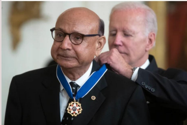
Gold Star father Khizr Khan is presented the Presidential Medal of Freedom by President Biden.