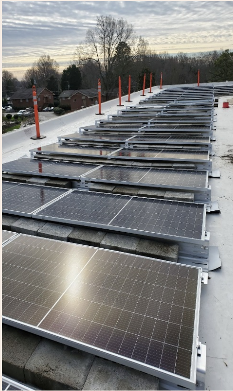
This photo shows a portion of our panels on the roof of the Cox building.

12th to July 20th (100 days) our solar panels generated 31,946 kWh of electricity. This is equivalent to: taking 4.9 average passenger cars off the road for one year; or eliminating the CO2 emissions from 2,549 gallons of gasoline. Another way to look at it is to compare it to the carbon sequestered by 391 tree seedlings grown for ten years. Pullen Memorial Baptist Church is making a difference! ( Greenhouse Gas Equivalencies Calculator | US EPA )