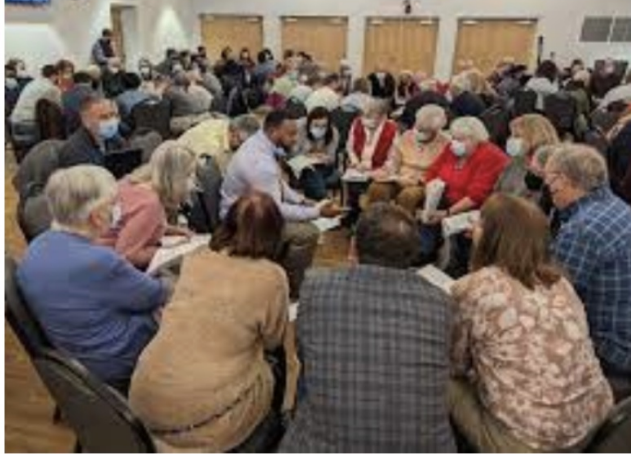
ONE Wake Listening Session Launch